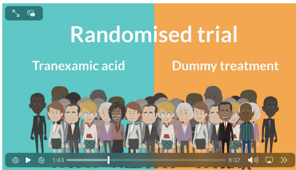
Figure 1: Screenshot of informational voiceover-translated animation.